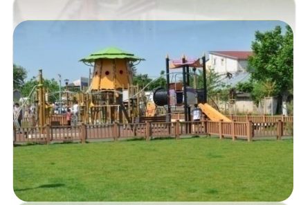
MISSION, VISION, REALITY